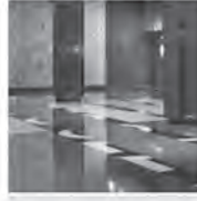
METAL AND STONE MAINTENANCE AND RESTORATION