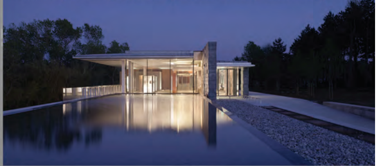
Normandy American Cemetery Visitor Center, SmithGroup