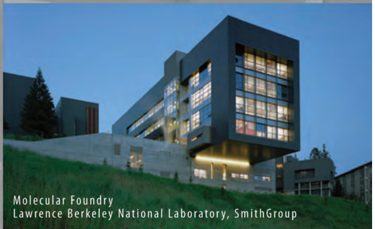
Molecular Foundry Lawrence Berkeley National Laboratory, SmithGroup