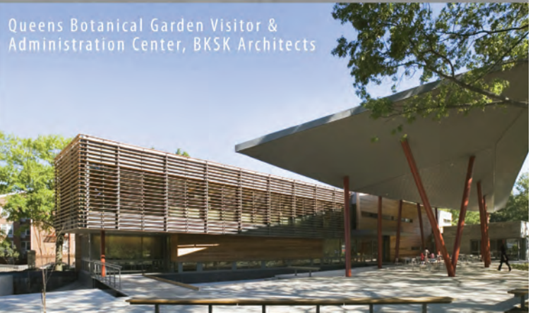
Queens Botanical Garden Visitor & Administration Center, BSKK Architects