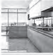
LUXURY RESIDENTIAL DETAILING