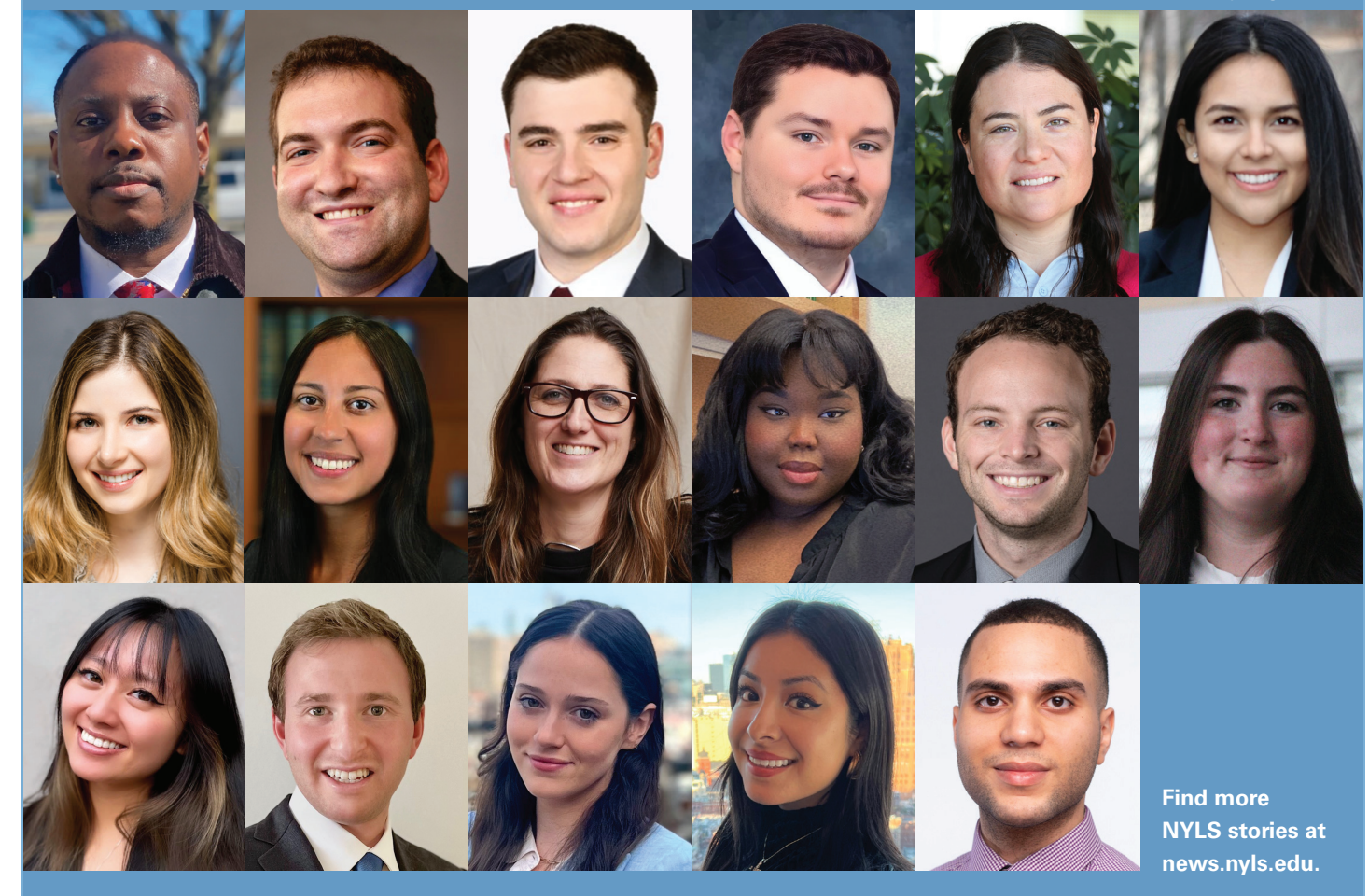
NYLS Student Bar Association • Published Spring 2024

Throughout the year, the NYLS Student Bar Association highlights the achievements and contributions of members of the student body, who are nominated by their peers, with the "Humans of NYLS" series. Interested in meeting more Humans of NYLS? Visit news.nyls.edu to read highlights of more of our students.