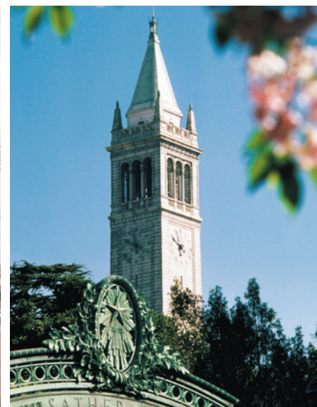
The Broad Institute of MIT and Harvard (left) and the University of California, Berkeley (right).

its state funding cut by $48 million in 2012 — holds a substantial number of patents that have not yet been licensed and has a famously low ratio of patent-licence revenue to research expenditure 7 . If its financial situation were to deteriorate further, the university might be compelled to extract licence fees from other research institutions for those patents.