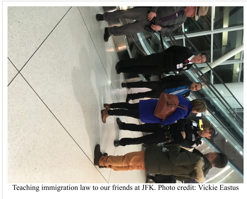
Teaching immigration law to our friends at JFK.

The immigrant community felt the impact of the executive order immediately. Individuals from the seven countries who were in transit at the time the Executive Order was issued were detained upon arrival at JFK International Airport and other airports throughout the country.